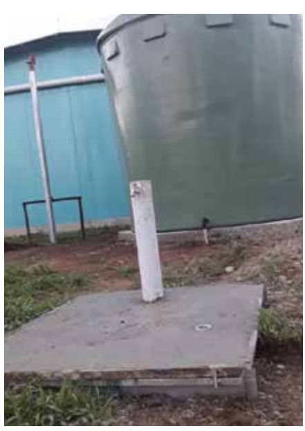
A tap stand and tank constructed for the project - yet to be fenced off from animals

Each village will have access to these community facilities. There will be sanitation training which will provide the people with the opportunity to have defined areas for toileting which is away from animals, cooking facilities etc.