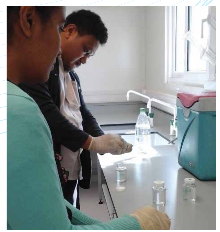
Water quality samples being prepared for analysis in the new laboratory.