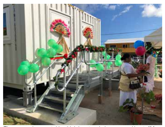
The new environmental health laboratory being prepared by staff for the official opening