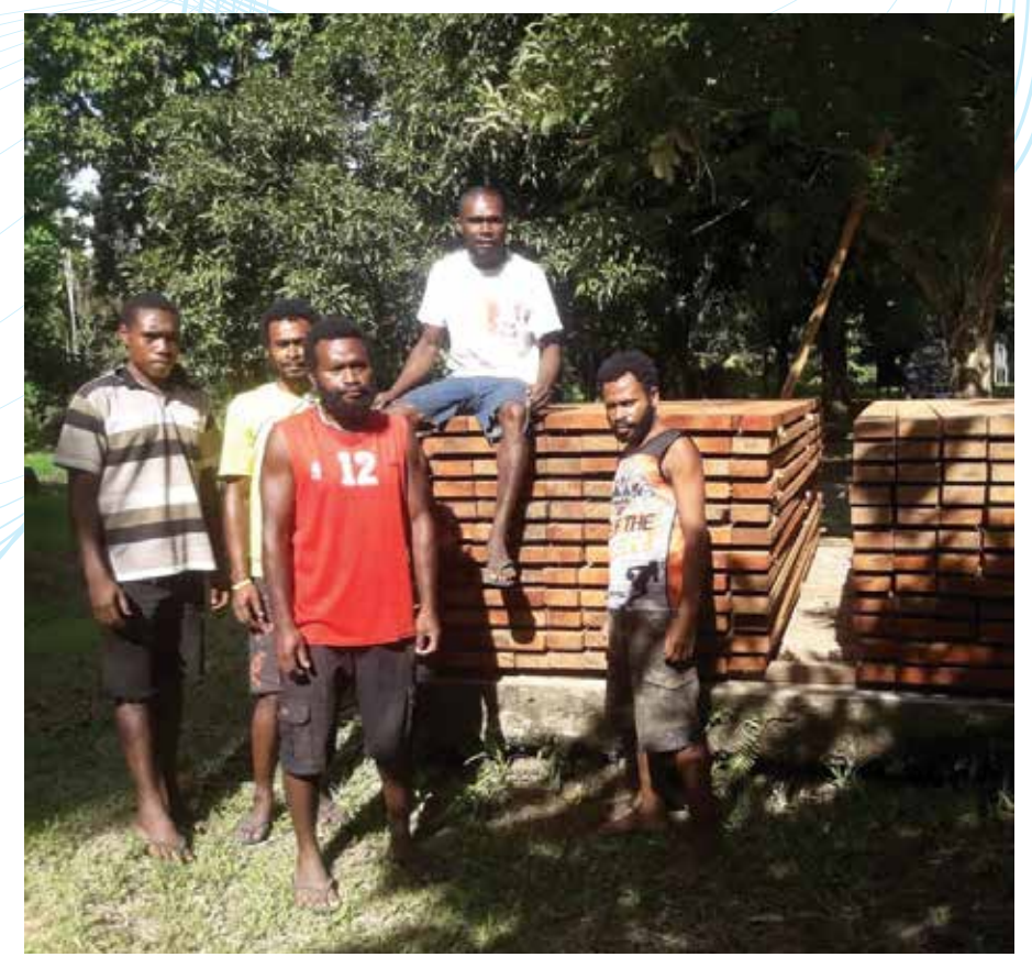
Some of the team on the ground in Bitokara